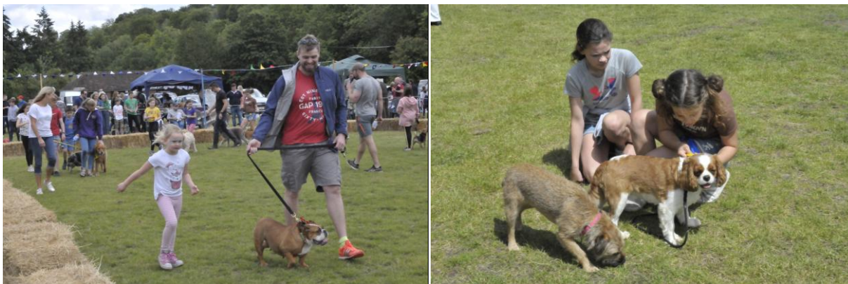
Dog show contestants