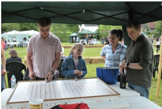
Deep concentration at shove ha'penny!