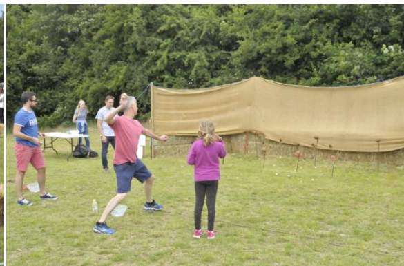
Dancers and coconut shyers (is that a word?)